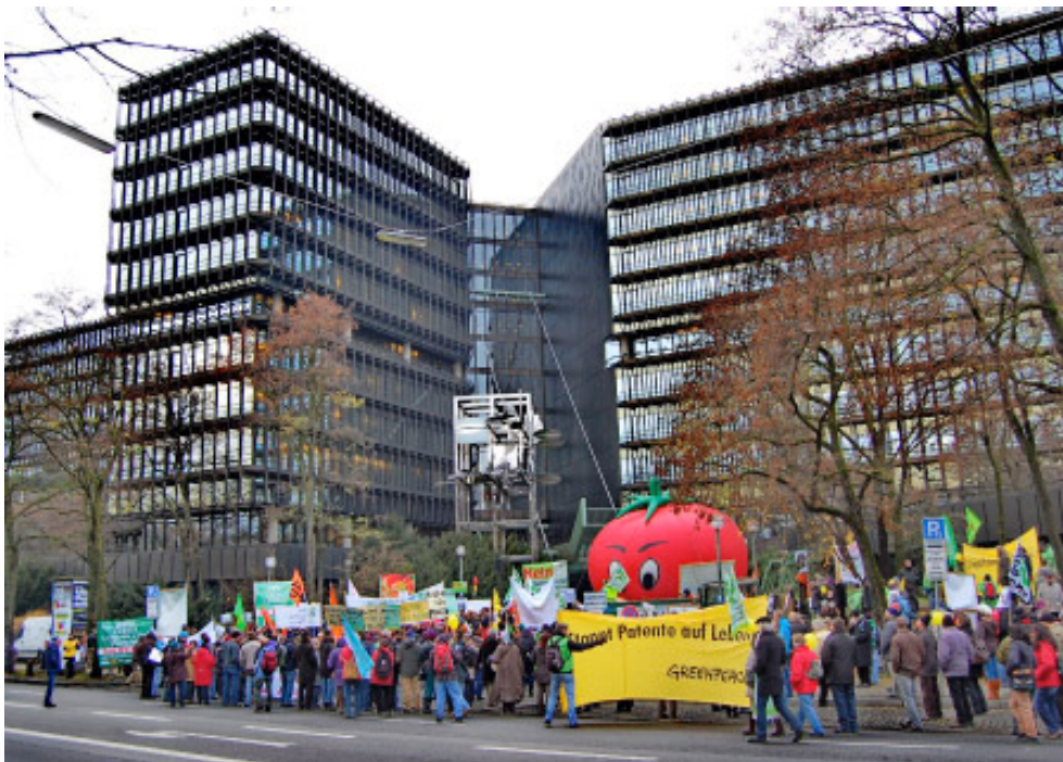
Photo: Public demonstration outside the EPO in November 2012

Surprisingly, as recent research shows, a whole series of new patents on plants will be granted in 2013. Whilst in the past, pending decisions at the Enlarged Board of Appeal were very often a reason to postpone further decision making on patents, it appears that the expected decision at the Enlarged Board (G2/12) has now become irrelevant – the interests of Monsanto, Syngenta & Co have become predominant at the EPO.