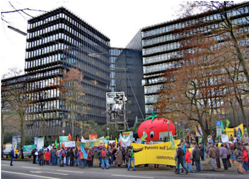
Photo: Public demonstration outside the EPO in November 2012

Surprisingly, as recent research shows, a whole series of new patents on plants will be granted in 2013. Whilst in the past, pending decisions at the Enlarged Board of Appeal were very often a reason to postpone further decision making on patents, it appears that the expected decision at the Enlarged Board (G2/12) has now become irrelevant – the interests of Monsanto, Syngenta & Co have become predominant at the EPO.